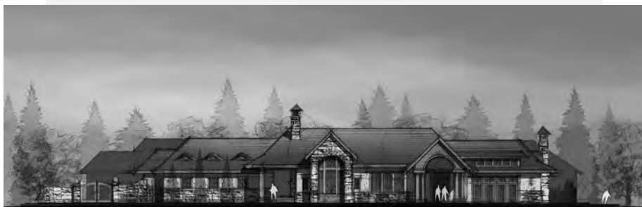
Pete Moore Hospice House

For many people, Festival of Trees has become a holiday tradition. Scheduled over six days during the Thanksgiving week, Festival now attracts approximately 18,000 people every year. Proceeds from previous years have exceeded all expectations, netting more than $9 million in support of quality healthcare in our community. This year we hope you will join us, with funds going to support Cascade Health's Pete Moore Hospice House.